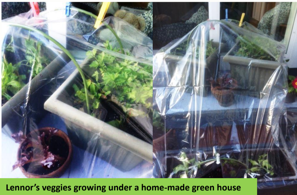
Lennor's veggies growing under a home-made green house

Take a look at these cool and easy ideas to keep your seedlings safe from low temperatures during the Spring.